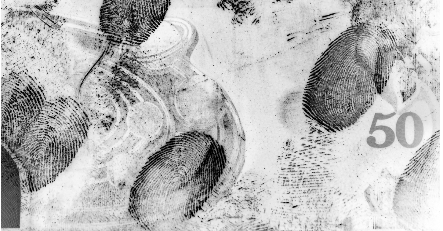
Fingermarks on a polymer banknote, developed using Cyanoacrylate